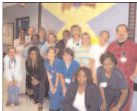
The Baptist Memorial Hospital-Memphis Emergency department team.

The McKesson Tracking Board, implemented in April 2007 in conjunction with a new triage methodology, has decreased turnaround times. The number of patients who left without being seen has declined significantly during the last six months and is below the national benchmark. The tracking board data have also aided in the reduction of nearly 15 minutes for diagnostic procedures. In addition, patients arriving by ambulance are being triaged within five minutes of arrival due to this project.