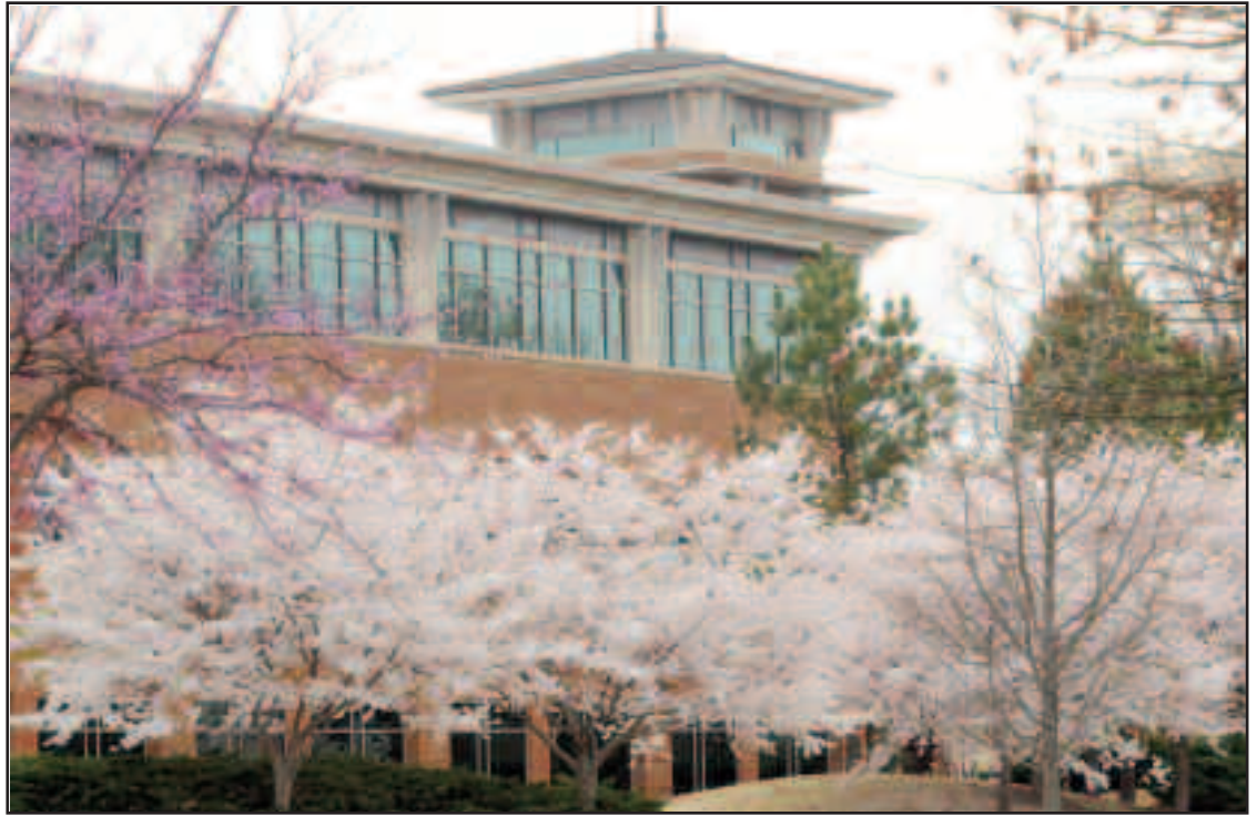
In full bloom Cherry blossom trees outside Baptist Memorial Hospital-Collerville were recently in full bloom.